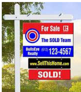
MAX. 5 FT. IN HEIGHT