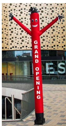
Positive air signs