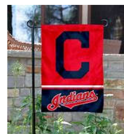
FLAGS – NOT REGULATED IF SECURED BY 1 EDGE