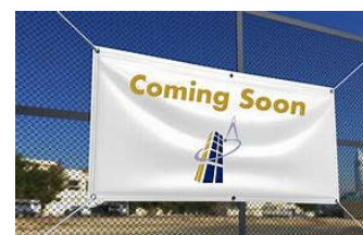
MAX. 4 FT IN HEIGHT GROUND OR WALL MOUNTED